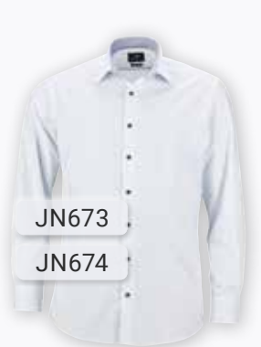
LADIES' | MEN'S SHIRT "WINGS"