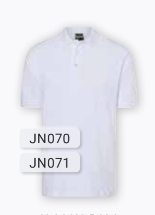
CLASSIC POLO CLASSIC POLO LADIES