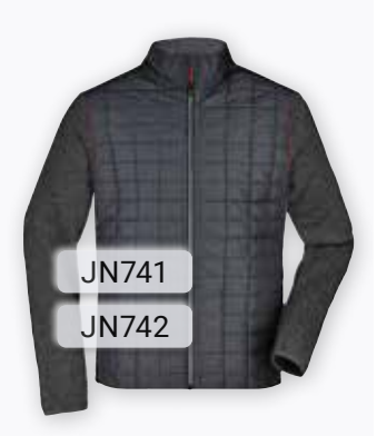
LADIES' | MEN'S KNITTED HYBRID JACKET