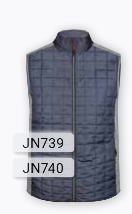
LADIES' | MEN'S KNITTED HYBRID VEST