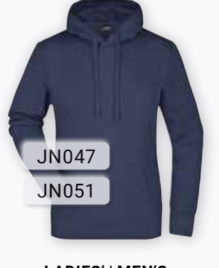
LADIES' | MEN'S HOODED SWEAT