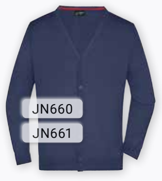
LADIES' | MEN'S V-NECK CARDIGAN