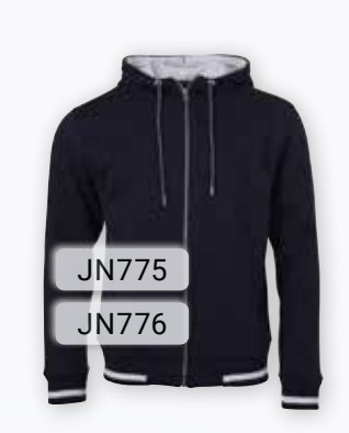
LADIES' | MEN'S CLUB SWEAT JACKET