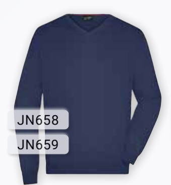
LADIES' DENIM BLOUSE LADIES' | MEN'S MEN'S DENIM SHIRT V-NECK PULLOVER