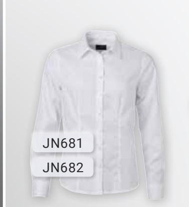
LADIES' | MEN'S SHIRT LONGSLEEVE MICRO-TWILL