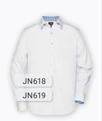
LADIES' | MEN'S PLAIN SHIRT