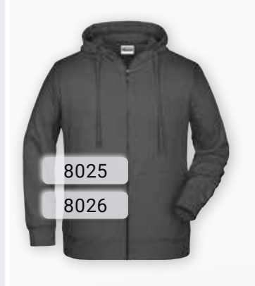
LADIES' | MEN'S ZIP HOODY