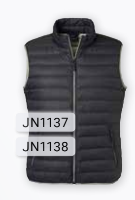
LADIES' | MEN'S DOWN VEST