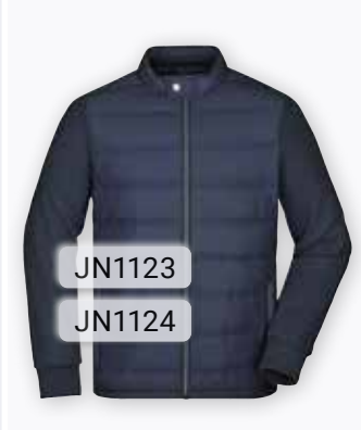
LADIES' | MEN'S HYBRID SWEAT JACKET