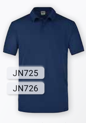
LADIES' | MEN'S POLO SINGLE STRIPE