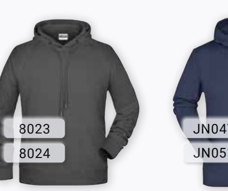
LADIES' | MEN'S HOODY