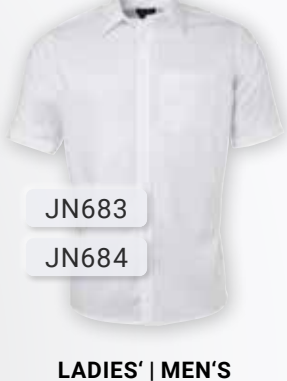
LADIES' | MEN'S SHIRT SHORTSLEEVE MICRO-TWILL