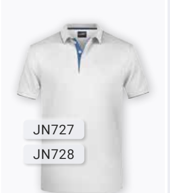
LADIES' | MEN'S POLO STRIPE