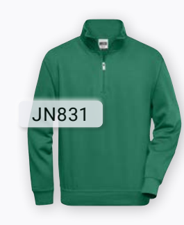
WORKWEAR HALF ZIP SWEAT