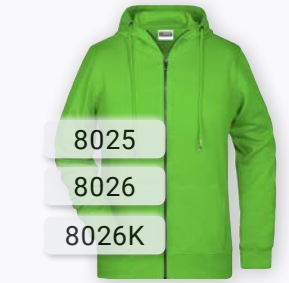
LADIES' | MEN'S | JUNIOR ZIP HOODY