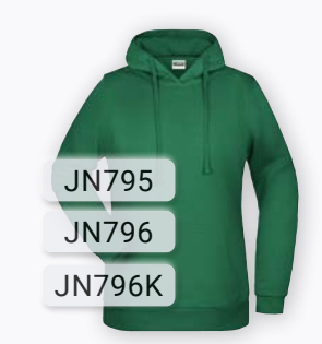
LADIES | MEN | CHILDREN PROMO HOODY