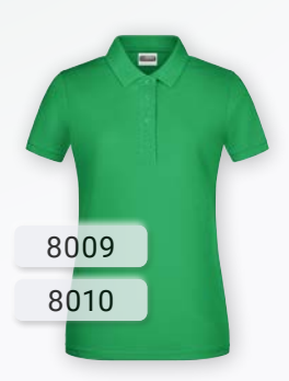
LADIES' | MEN'S BASIC POLO