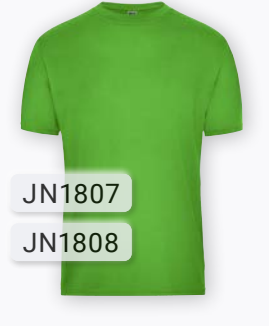
LADIES' | MEN'S BIO WORKWEAR T-SHIRT